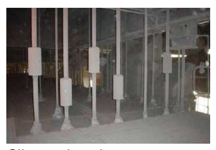
Sling rod seals

In addition, the company provides an expansion joint thermographic survey service together with 24/7 emergency breakdown cover. (24/7 cover is available only in the UK)